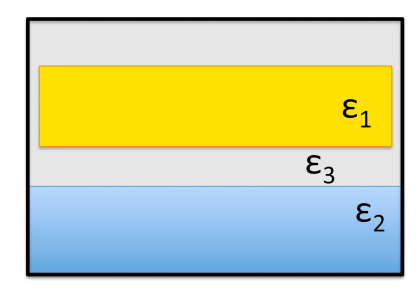
Fig. 1. Geometry of the setup. Two plates separated by an intermediate fluid.